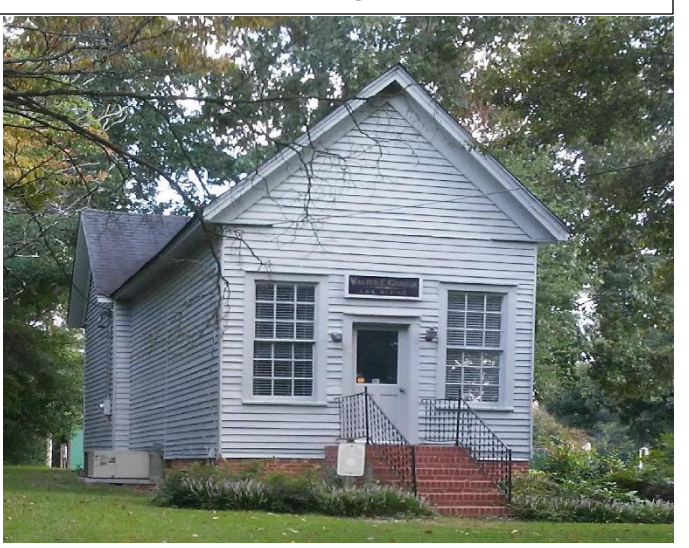
Walter F. George Law Office Museum Gets M<u>uch Needed</u> Facelift